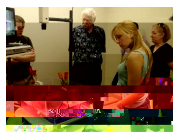
Figure 2 Students and faculty from the University of Delaware participating in the experiments.