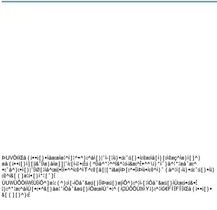
Figure 2. Percent of first-time undergraduate applicants admitted, and percent of admissions enrolled, by full- and part-time status: Fall 2015